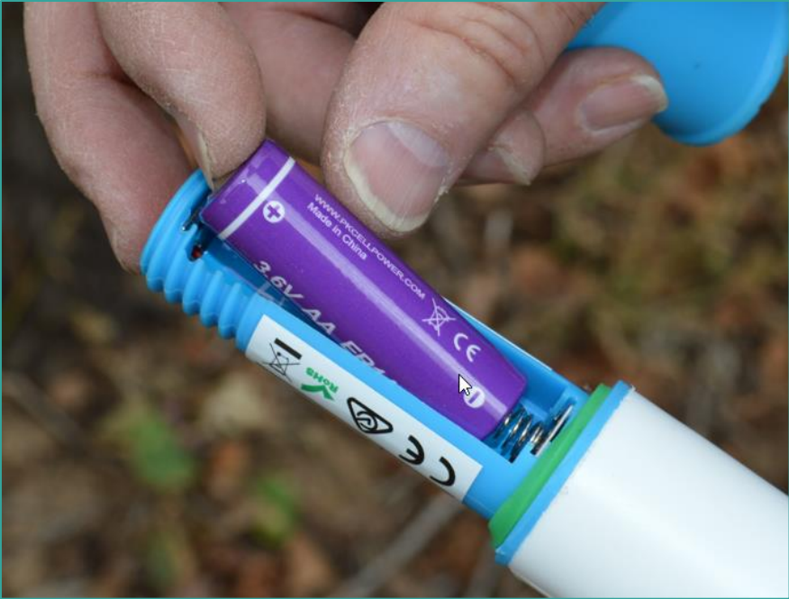
Remove the battery

Step 1 - Remove the battery cap and battery, check for any contamination and wipe away.